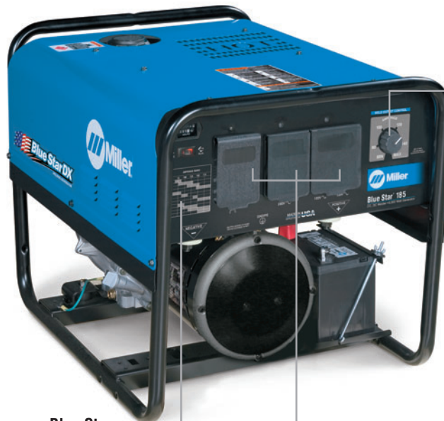
Blue Star 185 DX shown

Quick-reference parameter chart provides convenient amperage setting guidance.